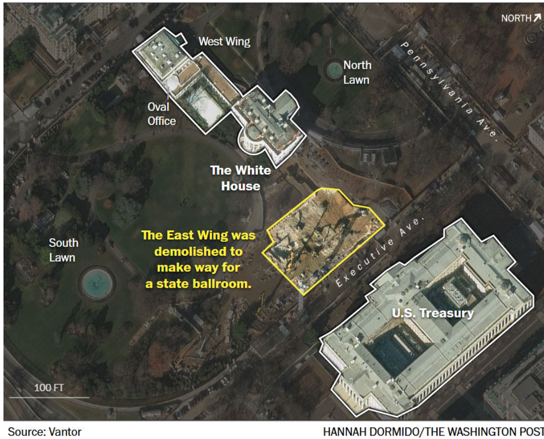
Figure 4 – Aerial view of the White House complex showing the West Wing, Oval Office, South Lawn, North Lawn, U.S. Treasury, and the former East Wing site marked as demolished to make way for a state ballroom.

34. Because of the extensive use of asbestos in building construction for several decades, repair, renovation and demolition of existing structures are a major pathway of asbestos exposure by construction workers, building occupants and bystanders. Assuring the safe removal and disposal of asbestos fibers during these activities has been a high priority of federal, state and local regulatory agencies.