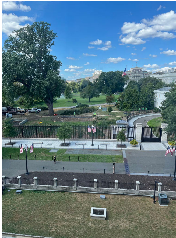
Figure 2 – View from the White House toward the North Lawn and Executive Avenue showing early demolition activity and tree removal at the former East Wing site.

21. On July 31, 2025, the White House issued a press release announcing plans to build a “White House State Ballroom” on the White House grounds to host “substantially more guests” than the current structure allows. The press release stated that “[t]he site of the new ballroom will be where the small, heavily changed, and reconstructed East Wing currently sits.” The release stated that “[t]he project will begin in September 2025.”