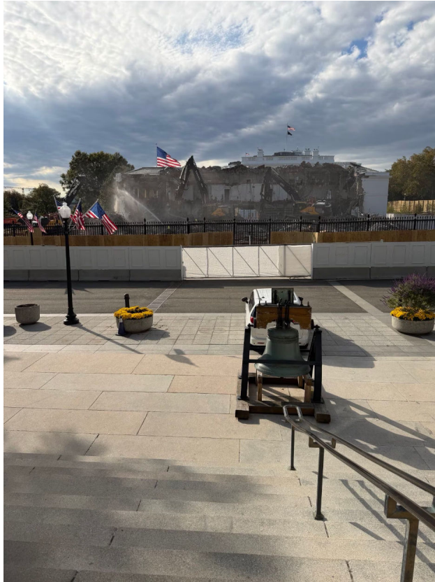
Figure 3 – View from Pennsylvania Avenue of active demolition of the East Wing, with excavators tearing into the structure behind security fencing, water spray controlling dust, and American flags lining the foreground walkway.

26. Despite a request from Massachusetts Senator Ed Markey , the White House provided no details on whether the construction debris from the demolition had been tested for the presence of asbestos and, if so, whether the contaminated debris was sent to a disposal site equipped to manage asbestos waste.